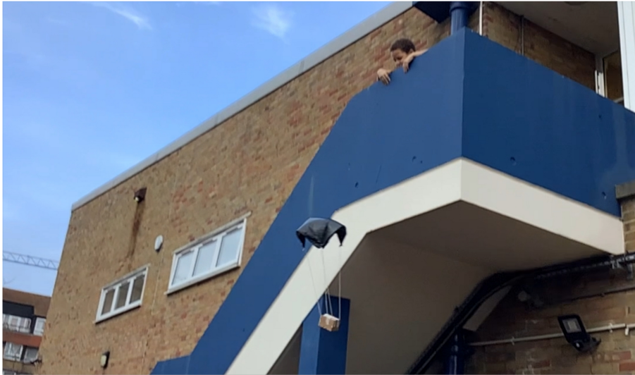
5RC creating parachutes to land an object safely back to earth.

We discover and realise the genius in everyone!