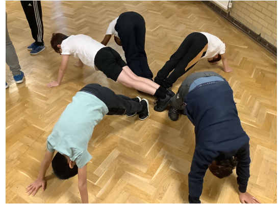
5HB in P.E.

This half term, we will be studying Floodland , by Marcus Sedgwick. The children will study grammatical features such as modal verbs and parenthesis. They will engage in discussions, which will include raising questions and debating ideas. They will write in a variety of forms, including letters and persuasive speeches.